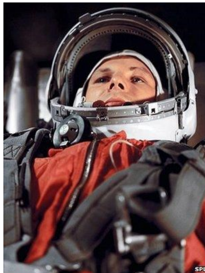
Fig. 1. Gagarin's name was immortalised when he made a single orbit of Earth on April 12, 1961. (Science reporters, BBC News, https://www.bbc.com/news/science-environment-12460720 )

The 12 April 1961 was the date of the first human space flight, carried out by Yuri Gagarin (Figs. 1, 2), a Soviet citizen. This historic event opened the way for space exploration for the benefit of all humanity.