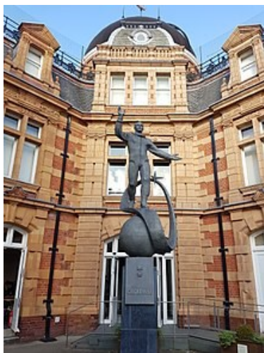
Fig. 4. Yuri Gagarin statue at the Royal Greenwich Observatory in London. https://www.rmg.co.uk/royal-observatory/attractions/yuri-gagarin-statue

In 2011 (on occasion of the 50-th anniversary of first human spaceflight), a statue of Gagarin was unveiled at the Admiralty Arch in The Mall in London, opposite the permanent sculpture of James Cook. In 2013, the statue was moved to a permanent location outside the Royal Observatory, Greenwich (Fig. 4).